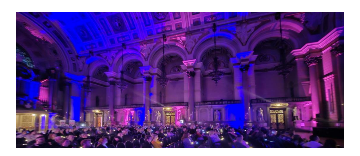
In 2023 479 adults and 92 children attended the service.

2 sessions of the service are held on the same day – an earlier session for adults and children and a later session for adults only.