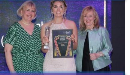
Team of the Year - NICU Infant Feeding Team