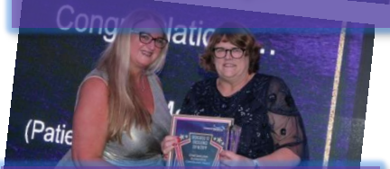
Outstanding Contribution Award – BBC Hospital. Neonatal Unit, Gynaecology department, Maternity service, and the Communications Team