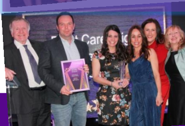
Dedicated to Patient Safety - Right Details, Right Treatment