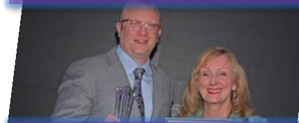
Foundation Award - ANODE: prophylactic Antibiotics for the prevention of infection following Operative DELIVERY