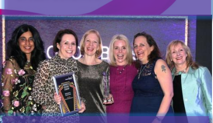
Staff Fundraiser of the Year - Choir raises funds for NICU