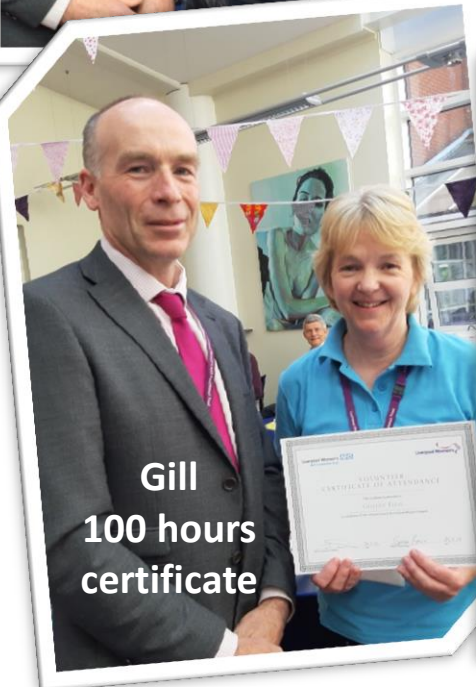
Gill 100 hours certificate