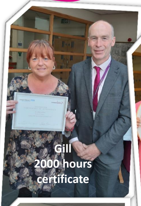
Gill 2000 hours certificate