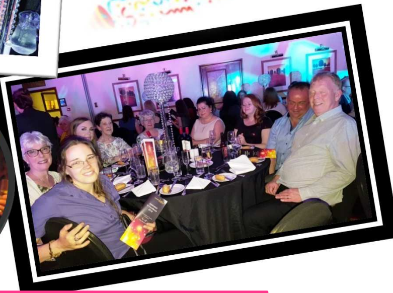
Pictures from the Dedicated To Excellence Awards Evening