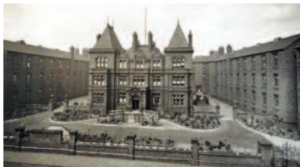
Mill Road Infirmary 1852

From the very beginning the hospital has had a strong charitable presence and it is due to supporters like you that we are now extremely fortunate to have the largest specialist hospital in the UK right on our doorstep.