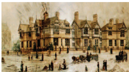
Brownlow Lying-in Hospital 1884