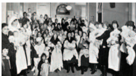
The Liverpool Maternity Hospital, Oxford Street 1926