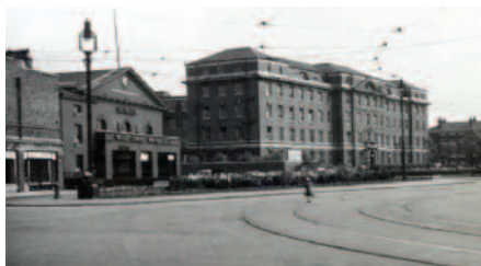
Mill Road Infirmary 1940