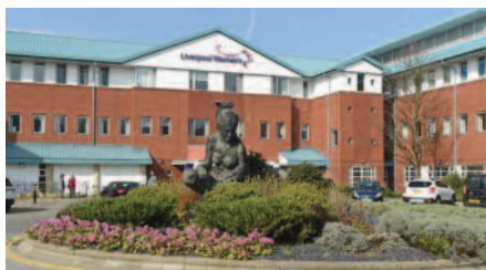
Liverpool Women's Hospital opened 1995